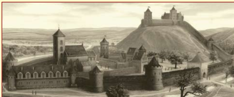
Castles of Vilnius in the 15th century (reconstruction drawing by Kitkauskas, Vaicekauskas, 2010)

As a former possession of Baltic and Prussian tribes, the territory between the sources of Alna and Drevanta Rivers and the lands extending further to the vicinity of the Vistula River occupied by the Teu-