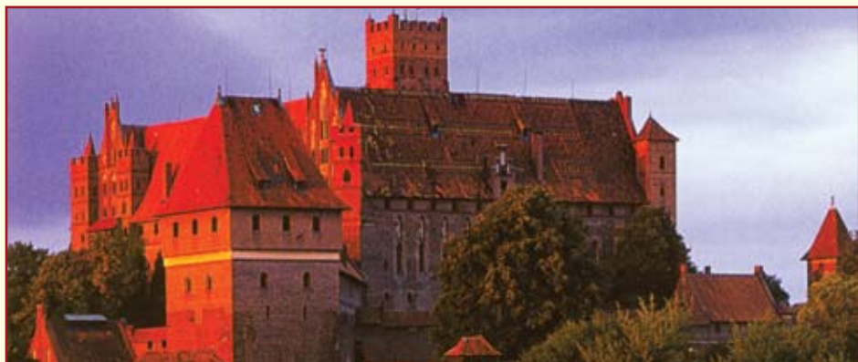
Marienburg Castle was built in the location of the former Baltic Prussian Castle: 1276 – 15th century, rebuilt in 18th-19th centuries, restored and preserved in 1794-1994 (Zamki panstwa krzyzackiego (2009))

The Livonian Order, which did not participate in the Battle of Tannenberg, was defeated in 1435 in the Battle of Sventoji – Pabaiskas. This ended the 250 years of the challenging war for freedom.